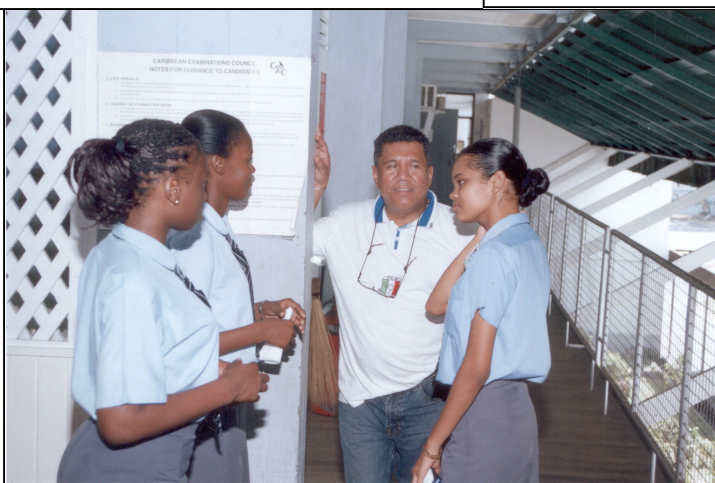
The author in conversation with senior students during his visit to Saints last November

These students can become role models to business by mastering the body of knowledge of core competencies, including skills for managing themselves, and by their dedication to continuous life learning.